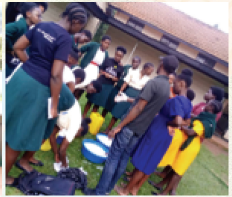
EDUCATE Club students during a skills training in soap making Writer's Club