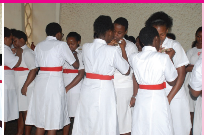
Badging and Dedication of the prefects 2019/2020

"For everything you do, you are paid back in the same currency but with interest".