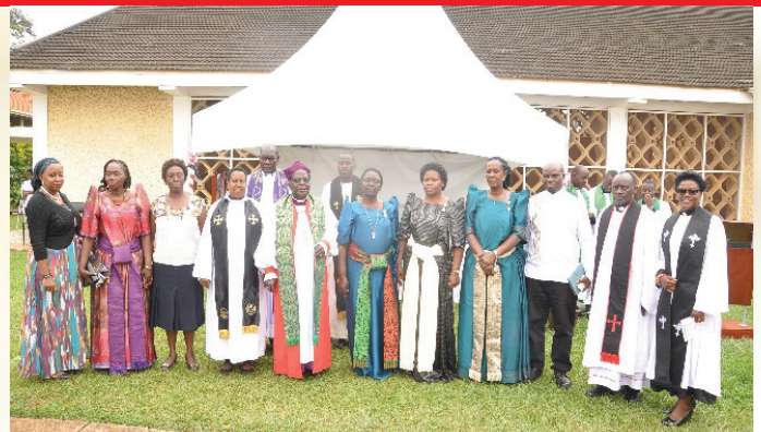
Some of the newly confirmed Brides in the Christian faith with the Bishop