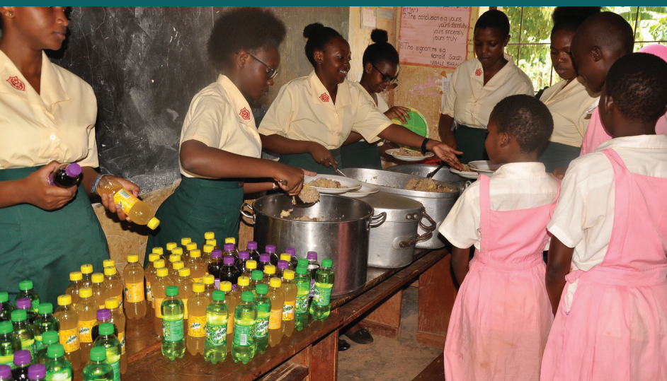
People to People International Club reaches out to Sitankya P.5,6 and P.7 Pupils to promote quality education and inspire the girls to keep in school