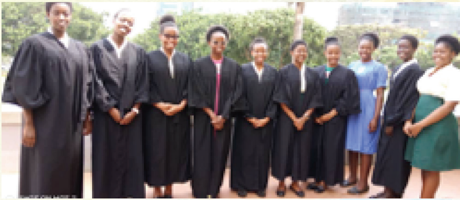
The Rule of Law Club at the finals of National Interschool Mooting Competition at High Court